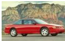
Stock 1994 Olds Cutlass