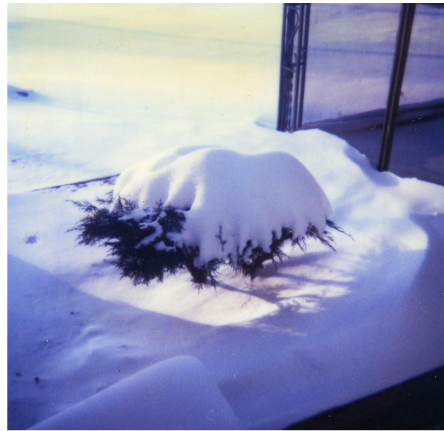
Snow outside the dining room windows

Wed Feb 17 – Fine day. Ate lunch with Norman Marose & wife at Family Table. I used to work with him.