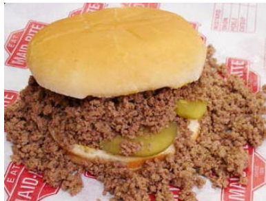
A Maid-Rite sandwich

Mon May 27 – Very quiet day. Watched Celtics beat Lakers 148 to 114 in pro basketball. Dalene phoned about how to make Maid-Rites < a loose-meat hamburger sandwich; these were first created in 1926 in a Muscatine café, and eventually franchised around the Midwest >.