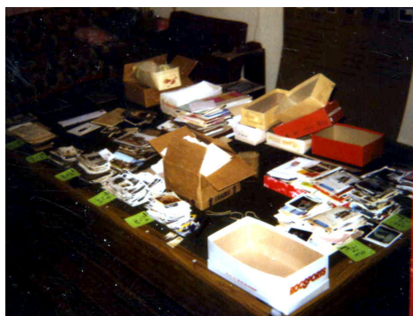
Sorting photographs on the pool table

Thu Jun 13 – Sorted 2 more shoe boxes of pictures.