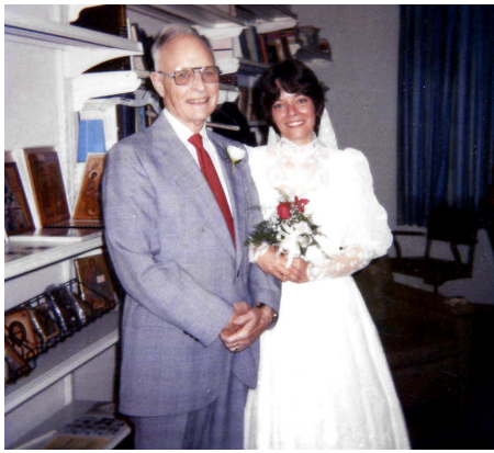
Father and daughter are ready