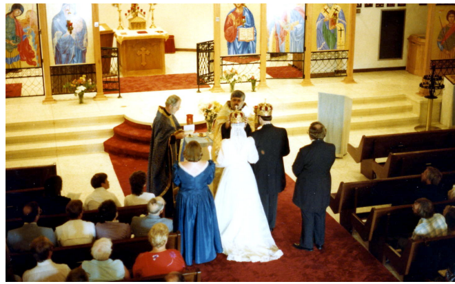
St. Innocent Orthodox Church, Tarzana, California