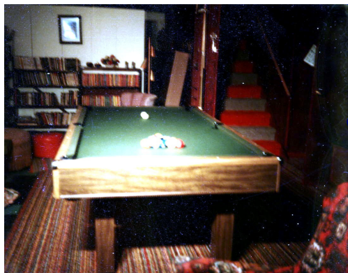
The pool table in Dale and Helen's basement

Sun Apr 4 – Helen washed some clothes. I played pool & watched pro basketball.