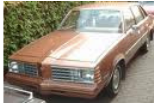
A 1980 Pontiac LeMans