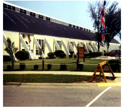
Great Lakes Naval Training Center

Thu Jul 2 – We all went to Chris's boot camp training graduation at Great Lakes. Very impressive. All night at Dalene's.