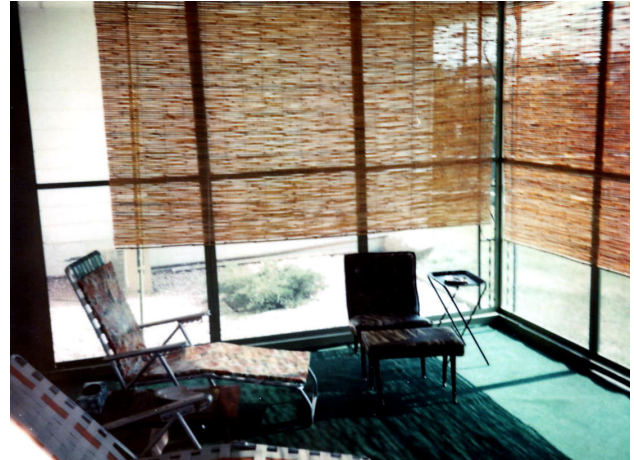
Interior of the patio