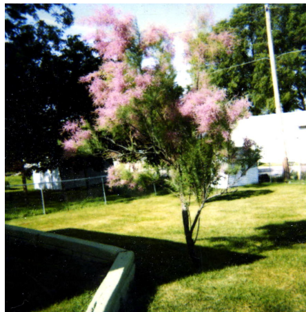
The tamarack tree

Tue Aug 3 – Beautiful day. Bought a historical book, set out the tamarack tree in the back yard, phoned Dalene. Mac & Wilma here.