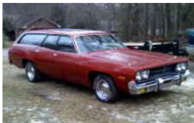
A 1974 Plymouth station wagon