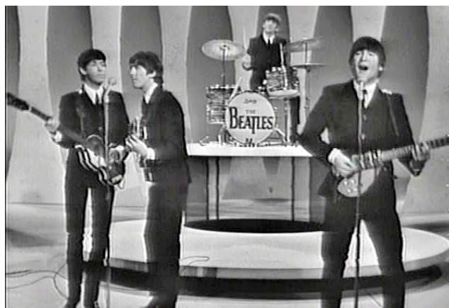
The Beatles appear on the Ed Sullivan Show