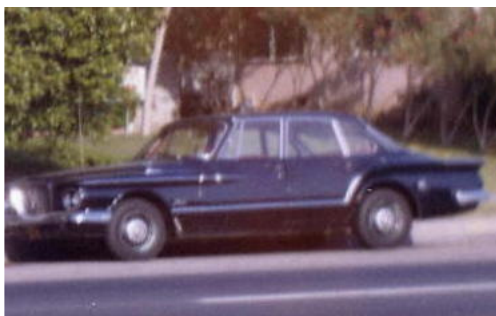
Dalene's 1961 Valiant

Wed Nov 23 – EPS. Dalene picked up her 1961 Valiant at Downtown Plymouth after work. Beautiful car, black with red, white & brown interior, etc. She put 80 miles on it.