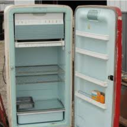
Vintage Coldspot (Sears) refrigerator

Wed Aug 11 - Pay day. Bought some frozen foods for our new Coldspot. Merle Osterquist at plant to visit unofficially. Cool.