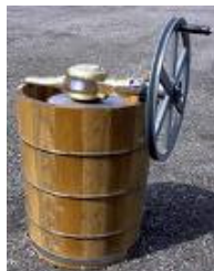
Hand-crank ice cream maker