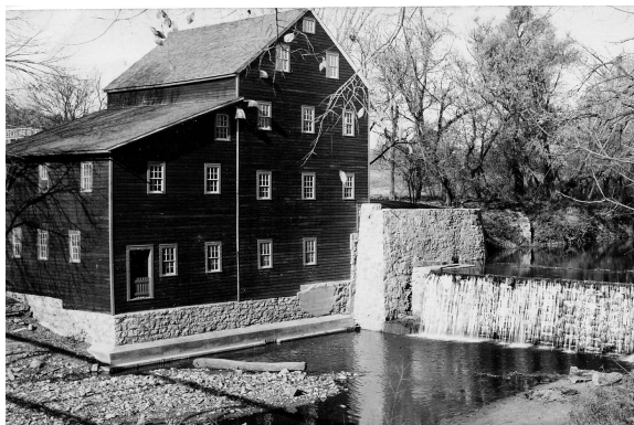
Pine Creek Mill in Wild Cat Den State Park, near Muscatine